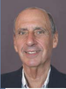
Deal Maker Problem Solver Global Contacts Sourcing Guru