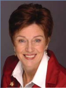
PhD Chemist Strategist Diagnostician Storyteller